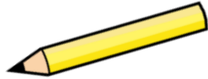
Pencil: 70 p

She bought a rubber for 30 pence and wants to buy a pencil.