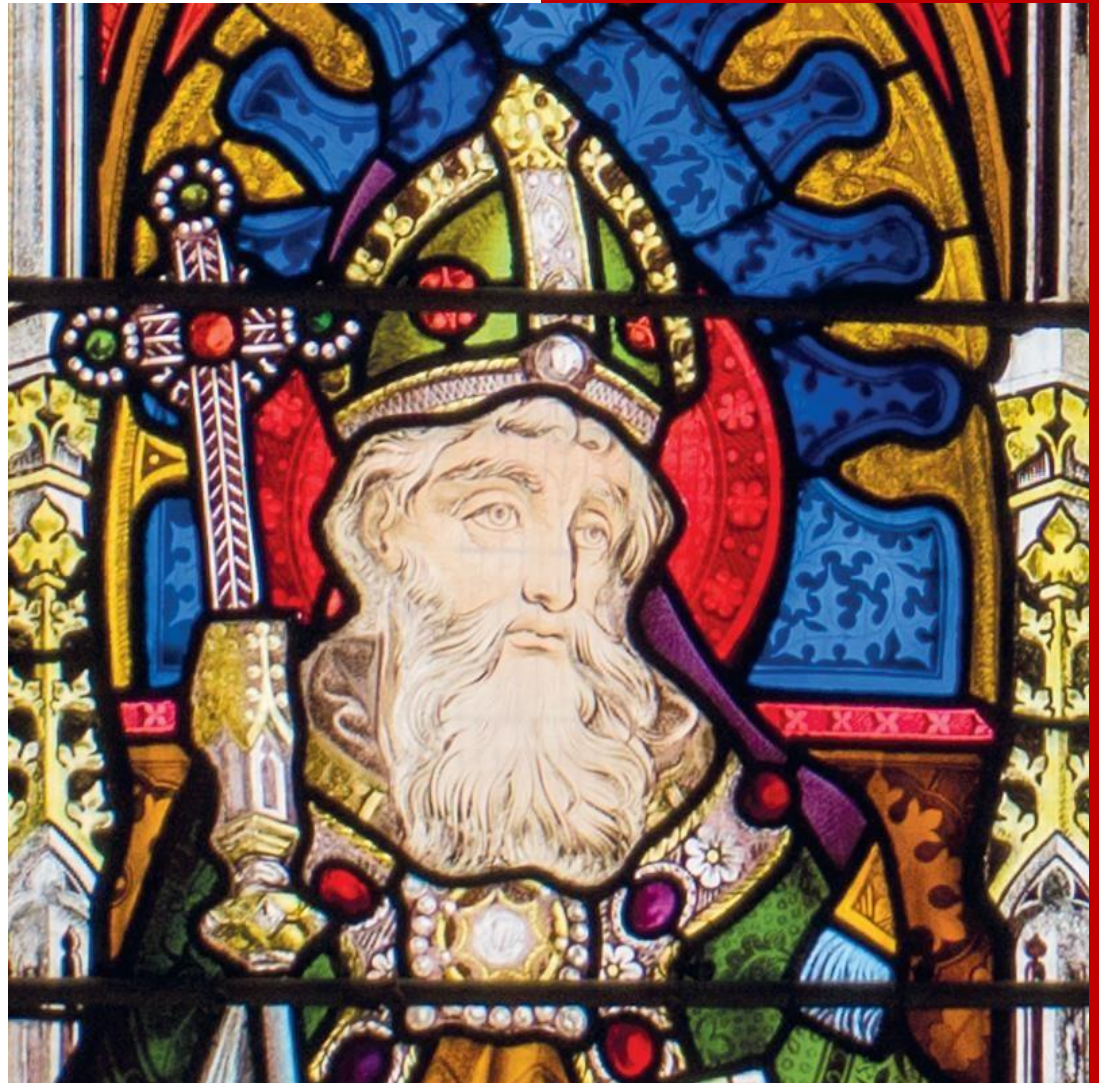
St John of Beverley (d. 721) in 19 th century glass from the Great West Window of Beverley Minster